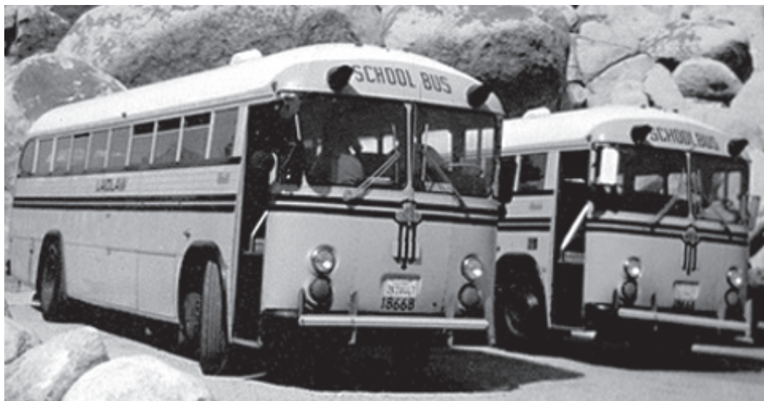
The CROWN-buses in their home country „California“

Two years later the second CROWN bus had been acquired and since then four busses have been rebuilt as moving restaurants. The fleet is so equipped that we can offer from a “dinner for two” tours to tours up to 55 people. (here we drive with two busses).