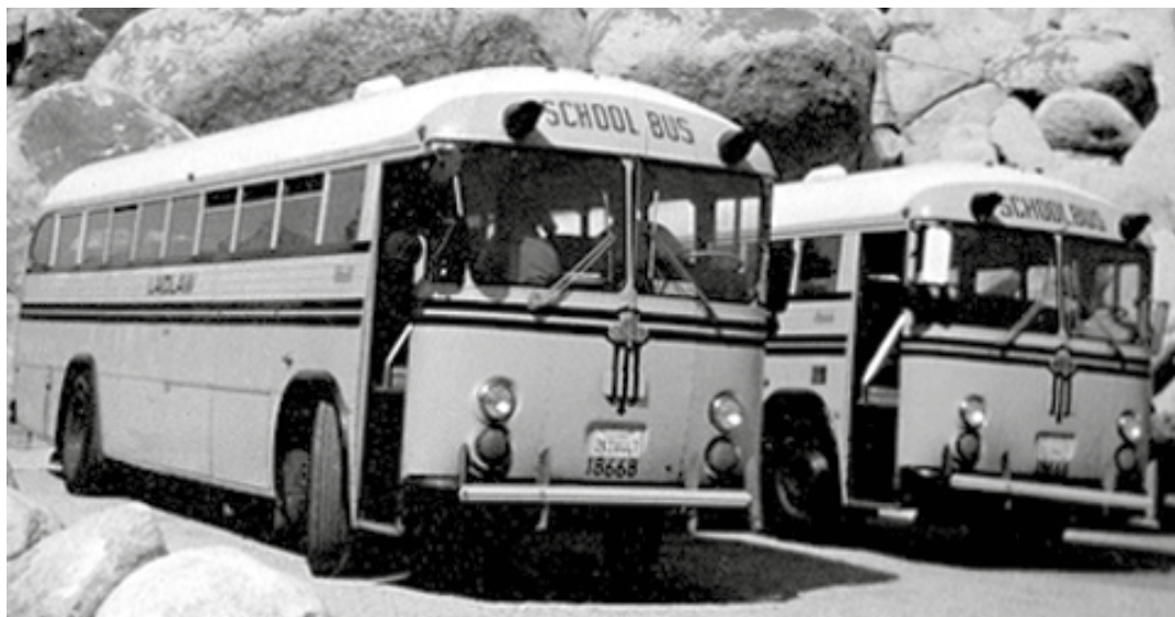
The CROWN-buses in their home country „California“

The fleet is so equipped that we can offer from a “dinner for two” tours up to 55 people tours (here we drive with two busses).